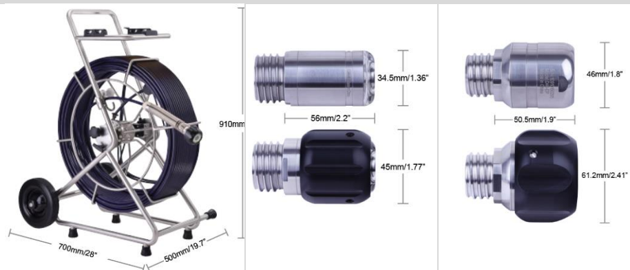
Standard size systems